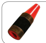
DETAIL: The Mud Gun Discharge Nozzle.