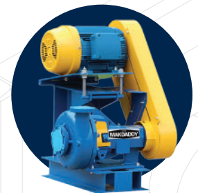
PSI's MAKDADDY Pump with enhanced shaft guards.